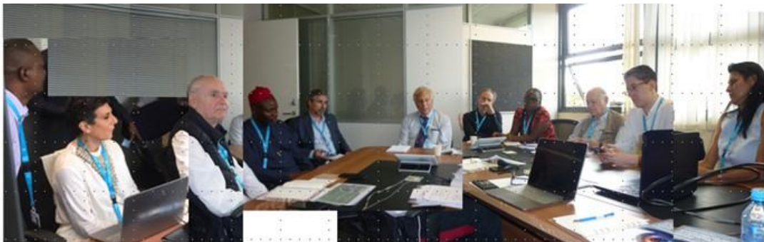
Heritopolis meeting UNHabitat Assembly, Nairobi, 5 June 2023